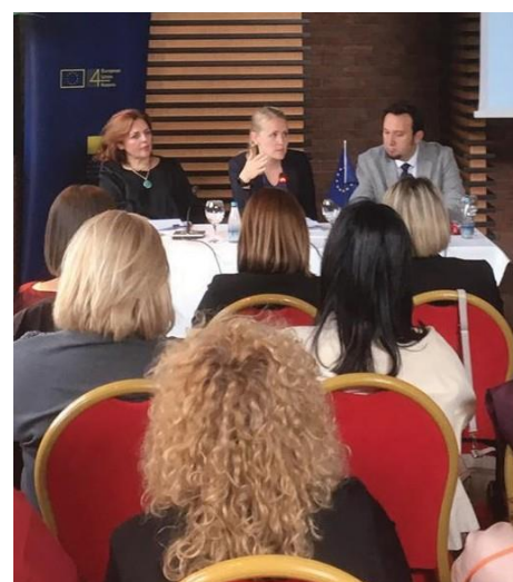
Photo: EU4K launched grant scheme Peja, October 2019

Following the delivery of the six, 2 day information session/workshops, the project team offered, to potential applicants, additional support through a one hour face to face mentoring project clinic.